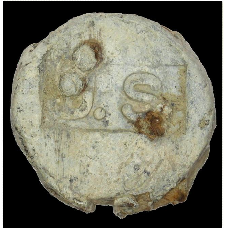
A reverse showing the U.S. stamp.

discovered that the site is part of what was originally Lashenden (Headcorn) Airfield, then RAF Lashenden and later known as USAAF Station AAF-410. This is obviously the connection, although strangely hardly any other related artefacts were found apart from the odd .50 calibre casing. The seal measures 13mm x 14mm and weighs in at 4.41gm.