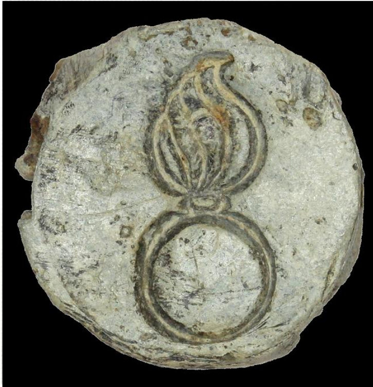
Front of a lead seal showing the flaming bomb motif.

Recently on a Medway History Finders dig near Headcorn in Kent, despite a lack of anything really remarkable finds wise, we did locate a number of these small lead seals. Normally we find bag or cloth seals, but these examples looked to be a little bit different.